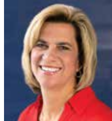
MARIANNE DIRUPO SUPERIOR PERFORMANCE CLASS OF 2020

The USBC Hall of Fame was created in 2005 by merging the former American Bowling Congress and Women's International Bowling Congress Halls of Fame. With the 14 new members of the 2020, 2021 and 2022 USBC Hall of Fame classes, there are 446 USBC Hall of Famers - 228 in Superior Performance, 125 in Meritorious Service, 53 in Veterans, 22 in Pioneer and 18 in Outstanding USBC Performance.