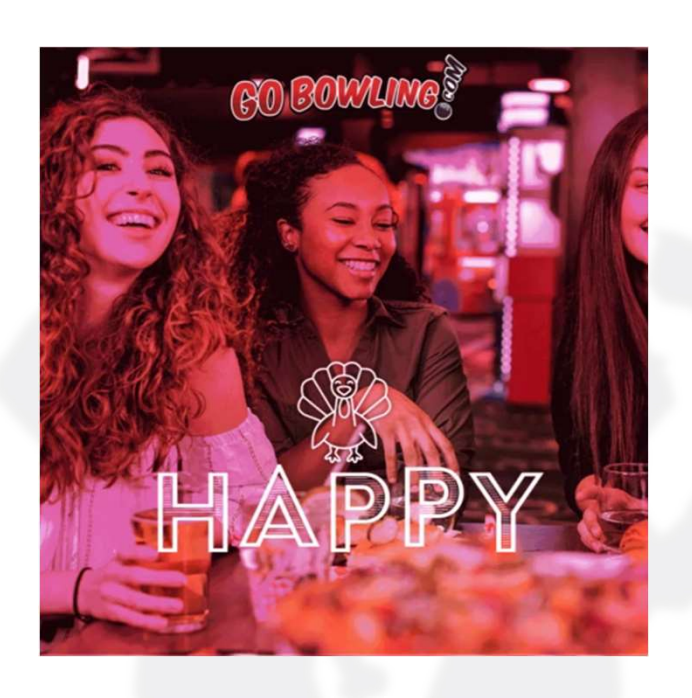
SOCIAL MEDIA CAMPAIGNS